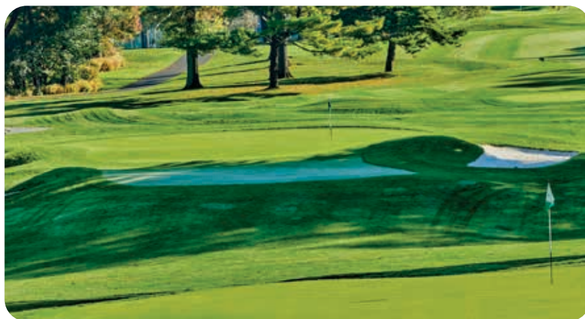
Exceptional quality. A metropolitan Philadelphia course recently trialed Rayora, the latest fungicide from FMC Corporation, on its creeping bentgrass tees.

overseen trials at their courses, including a superintendent currently at a course in the metropolitan Philadelphia area.